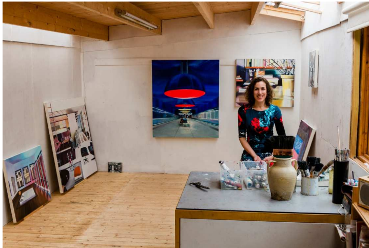
Studio View.