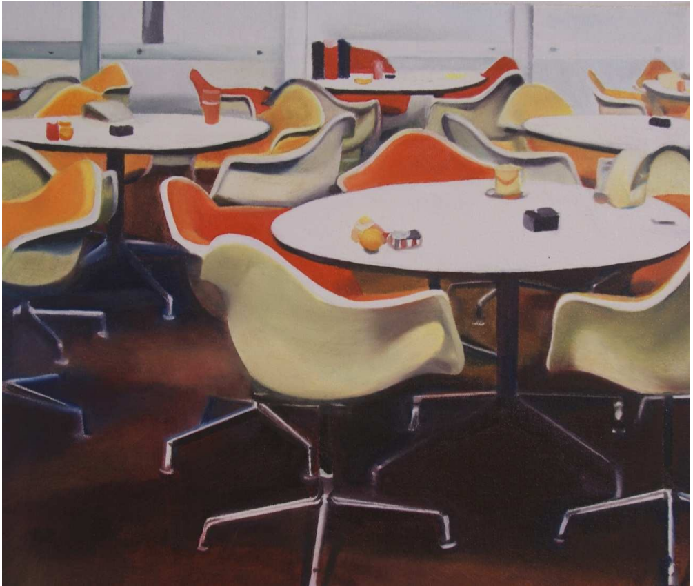
Stay Seated 2020 oil on canvas 37.5 x 44cm