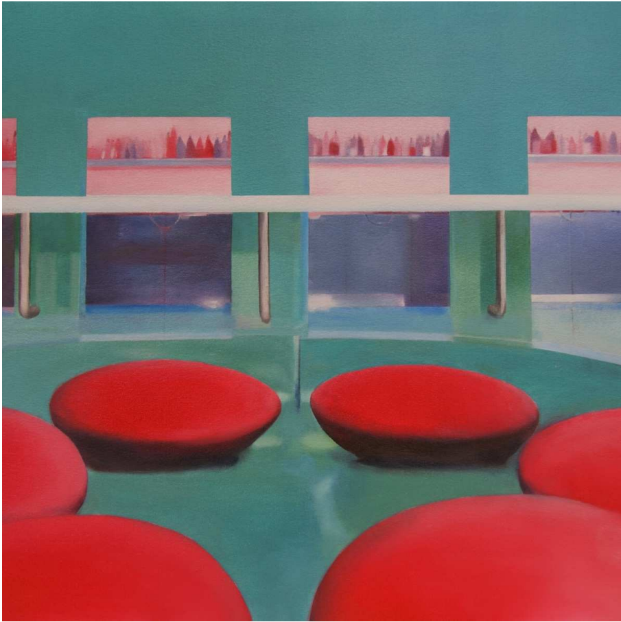
Caustic Café 2020 oil on canvas 67 x 75.5cm