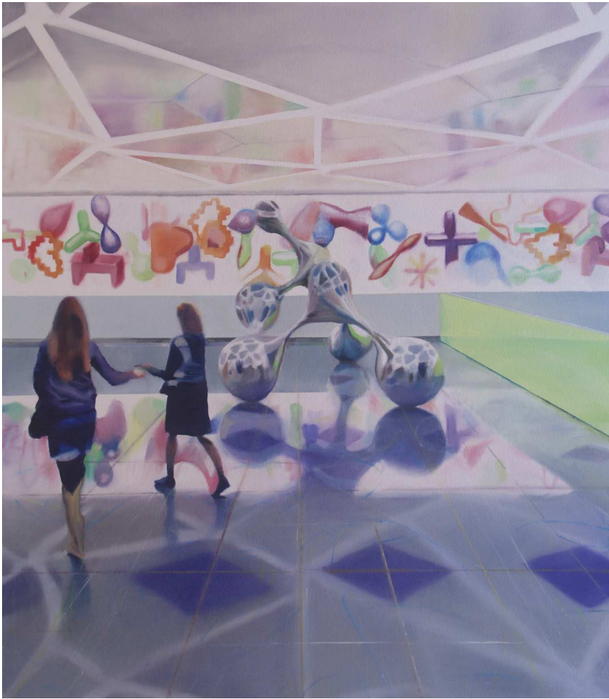
The Human Touch 2019 oil on canvas 83 x 94cm