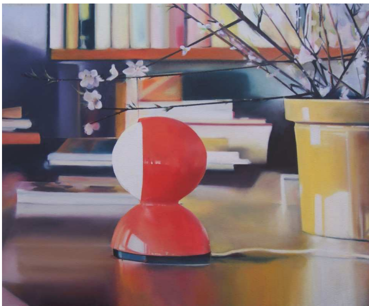
DeskTop 2017 oil on canvas 66 x 80cm