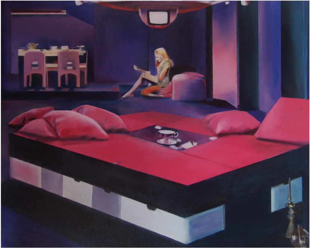
Panton's Girl 2019 oil on canvas 54 x 66cm