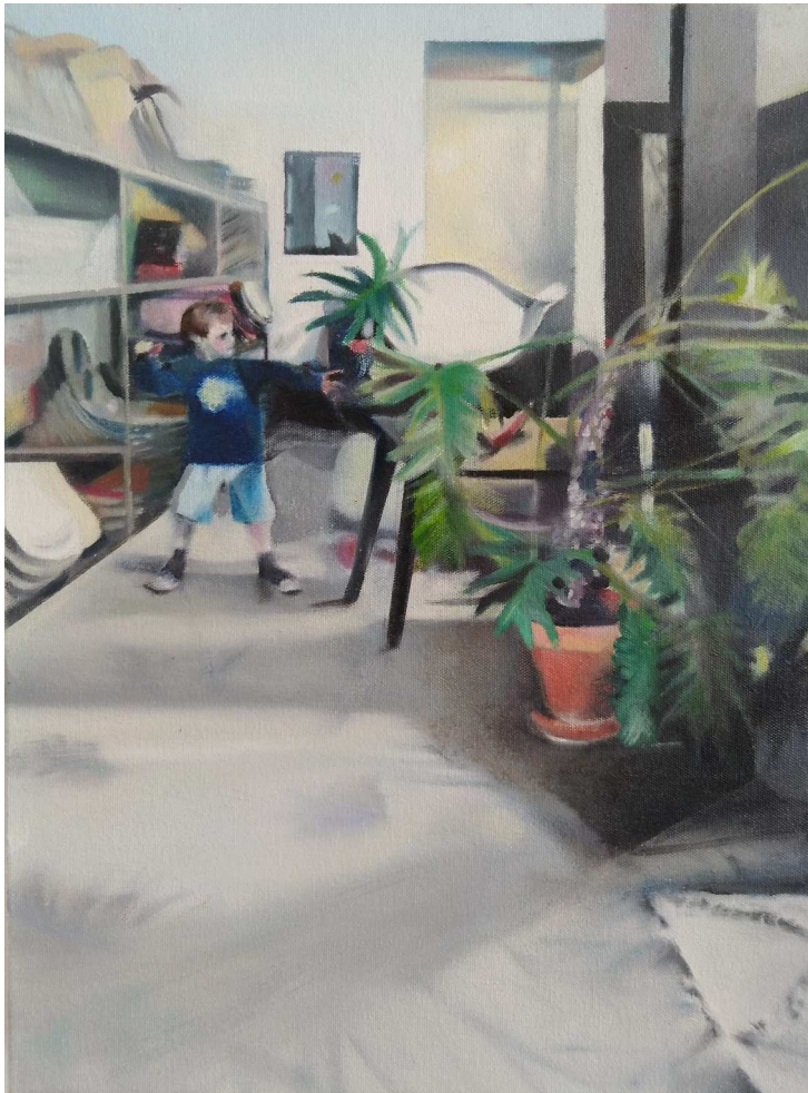
Ben in the Workshop 2017 oil on canvas 41 x 31cm