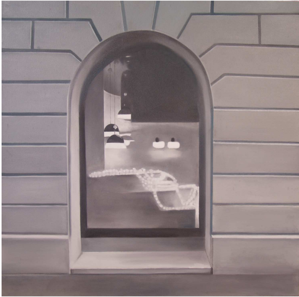
A Way Through 2021 oil on canvas 88 x 88cm