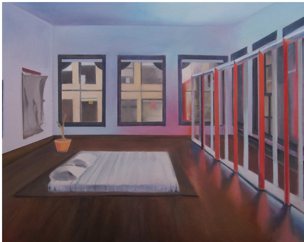
Donald Judd's Bedroom, 101 Spring Street, NY 2017 oil on canvas 63.5 x 79cm