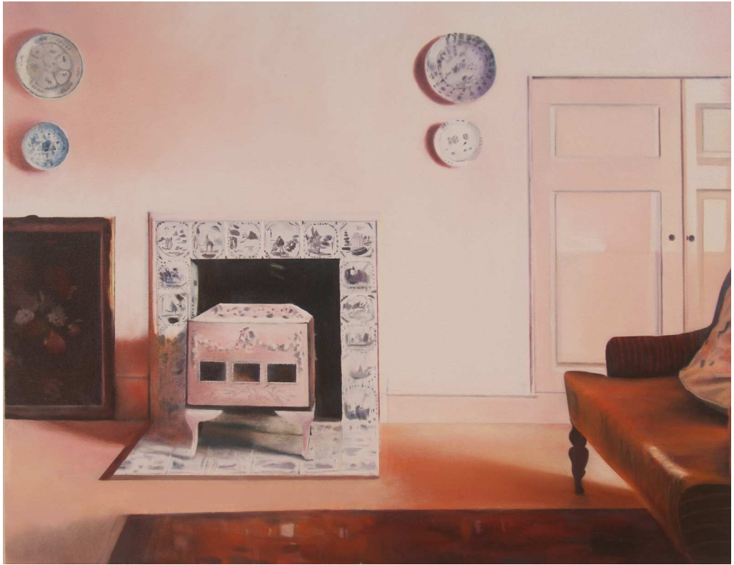
Holding Time 2021 oil on canvas 66 x 85cm