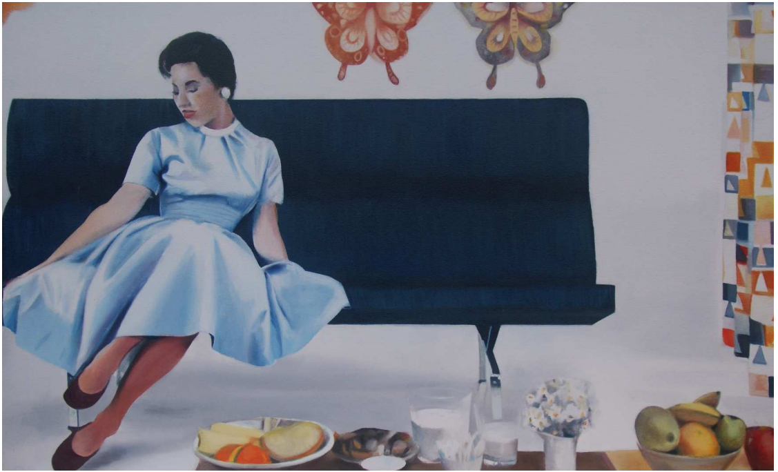
The Lady 2021 oil on canvas 72 x 119cm