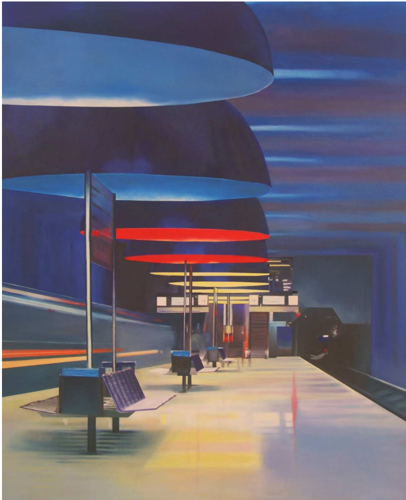
The Future Starts Here 2019 oil on canvas 147 x 124cm