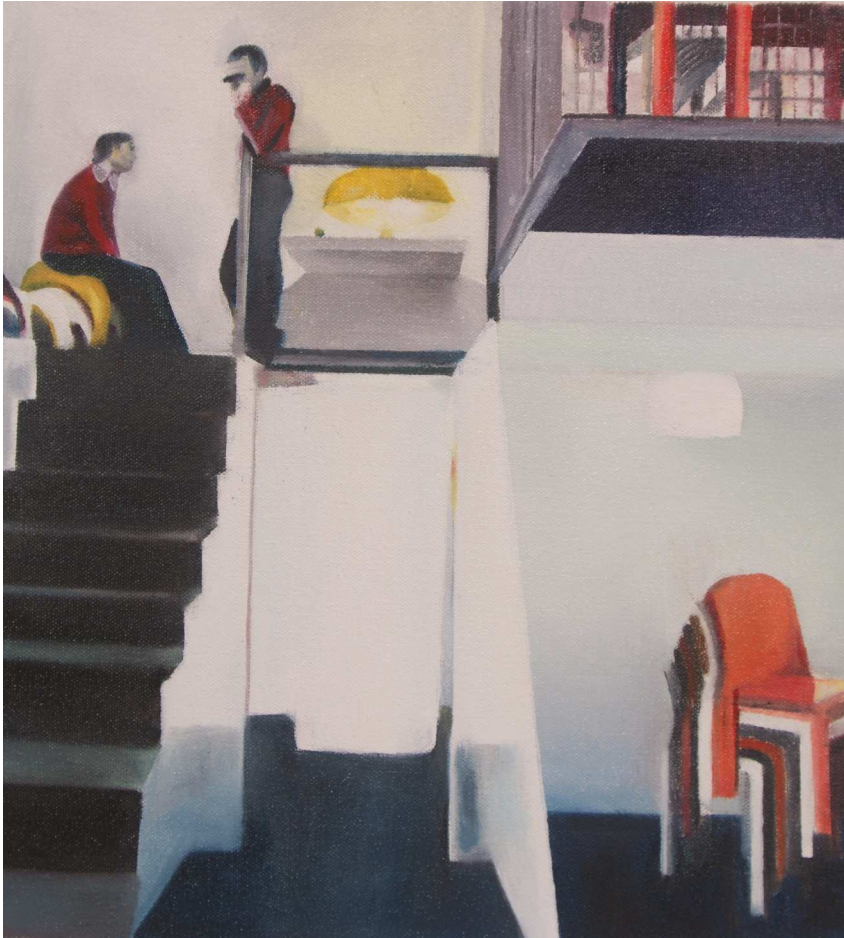
The Stairs 2020 oil on canvas 35 x 34cm