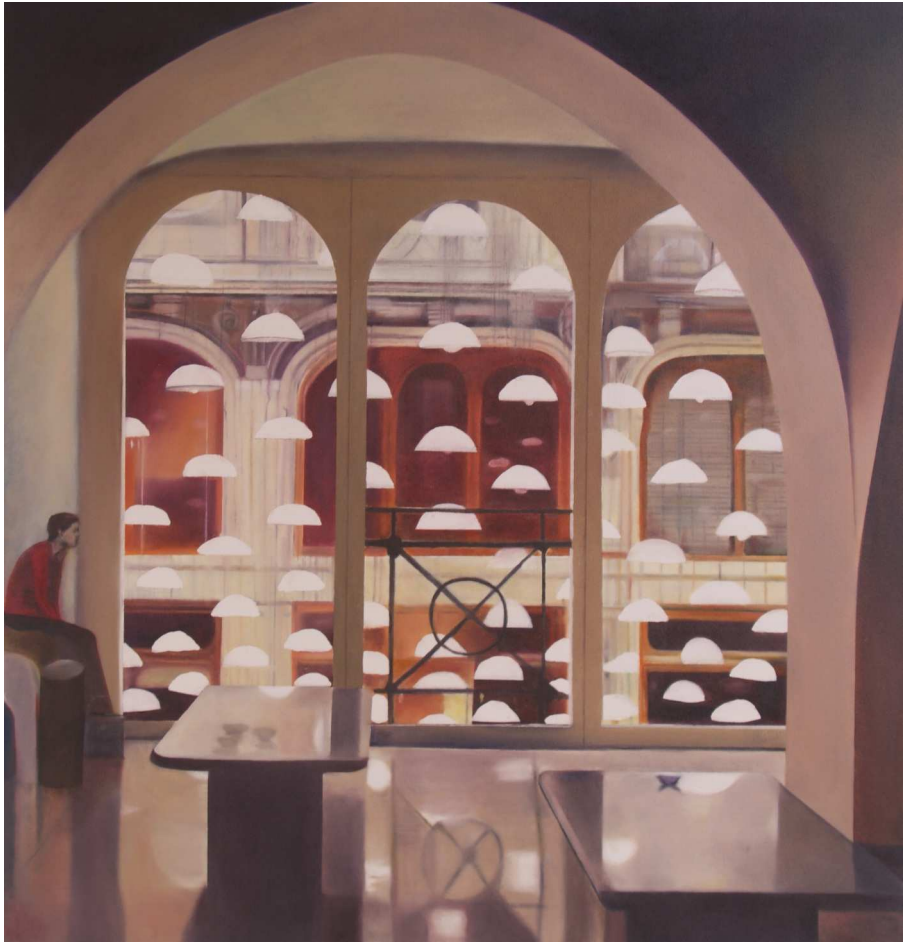
Archway 2021 oil on canvas 100 x 88cm