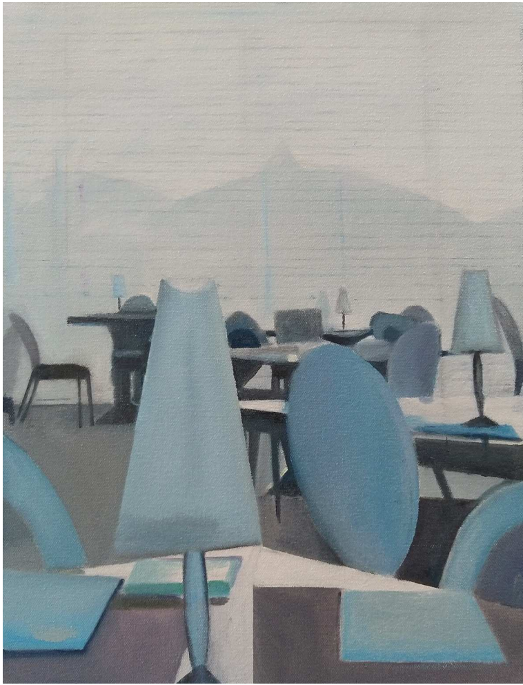
Felix 2021 oil on canvas 40 x 30cm