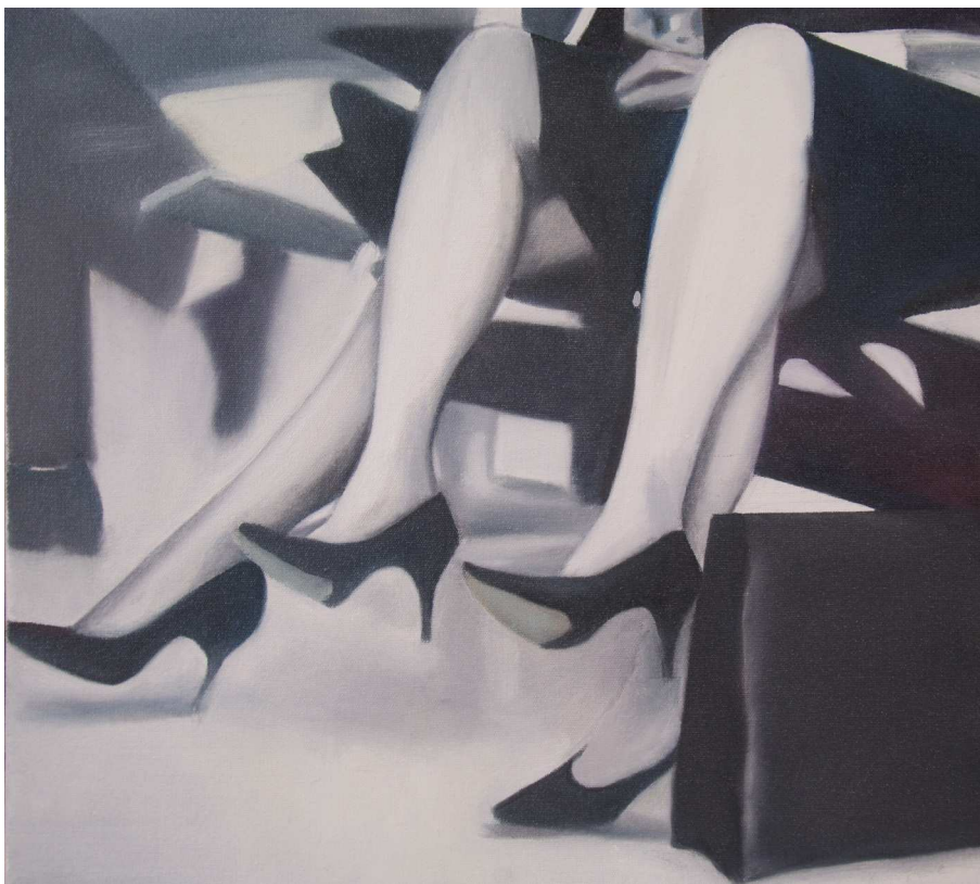
Flight No. 954 2021 oil on canvas 38 x 42cm